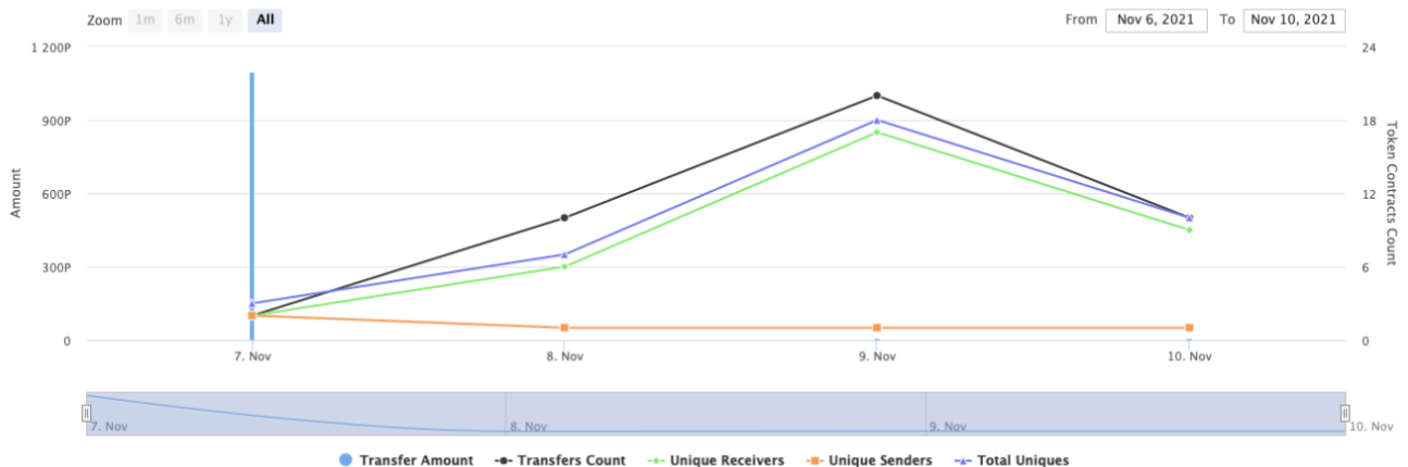
Token Contract 0x7fa6f63b11cc1af508cd19ba823853d6aacd9d65 (FireFlameInu)